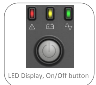
LED Display, On/Off button