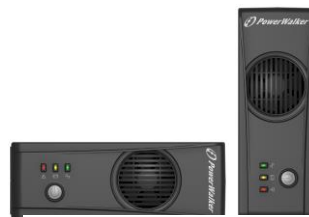
2-in1 Rack/Tower design